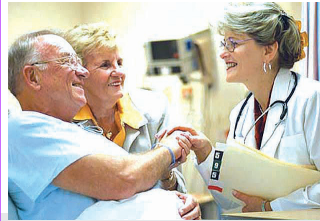
NURSING CARE FACILITY